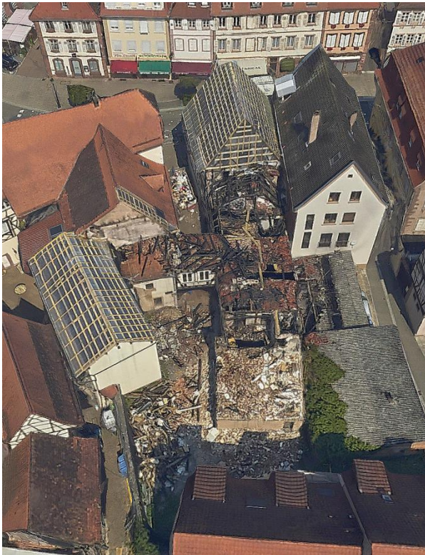
Figure 2: 3D Model showing a fire burned area of the city of Wissembourg/France generated with Skyline Software out of an OIS-XI 4B Mission 2019