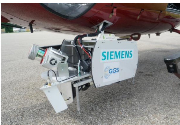
Figure 4: Monitoring system with 14 sensors for powerline monitoring, adaptable also for disaster mapping (Kemper 2018.)

As described in the previous part, some platforms are closely linked to the sensor. Satellites travel on discrete orbits and adaptations of the observed area are possible only by rotating the angle of view of the sensor. With the exception of Radar, satellites are depended also on weather conditions. But they are always operational and are able to collect data meanwhile overflying the project area. The resolutions are predefined. Aircraft are far more flexible for carrying various sensors, adopt the resolution by the variation of flight altitude and sensor, and are flexible for flight time. Nevertheless, they need a certain infrastructure and have to be available together with equipment and crew for an aerial survey. Some sensors have been developed for generating ultra-high resolution on Helicopters. This enables closer distance to the objects, lower airspeed, and short take-off and landing area. However, the costs are far higher than for a wing based aircraft.