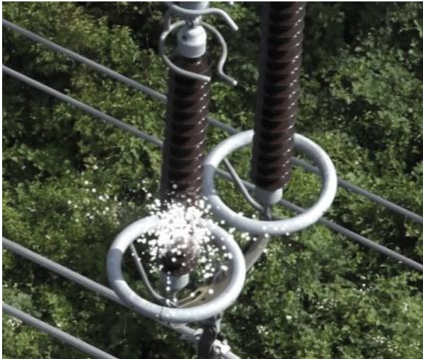
Figure 3: Discharge effects on a powerline (GGG GmbH 2019.)

The combination of these 2 sensors enable the direct overlay of the discharge spikes over an RGB Image