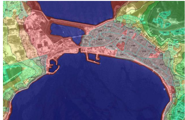
Figure 1: Tsunami Run-up simulation represented as a Map of an area near Istanbul calculated via GIS using land-use data and a DTM (Kemper et.al 2005)

Sensors for Data Contribution (Laituri and Kodrich 2008.) appear to give a new perspective for further bottom-up strategies in the field.